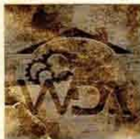
Director General, WDA